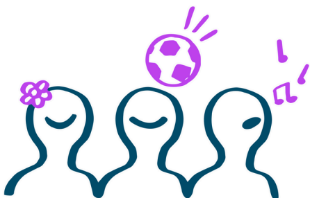
Heads On team

If you are fundraising for a particular ward or service please let us know so we can make sure the money you raise goes into the right fund.